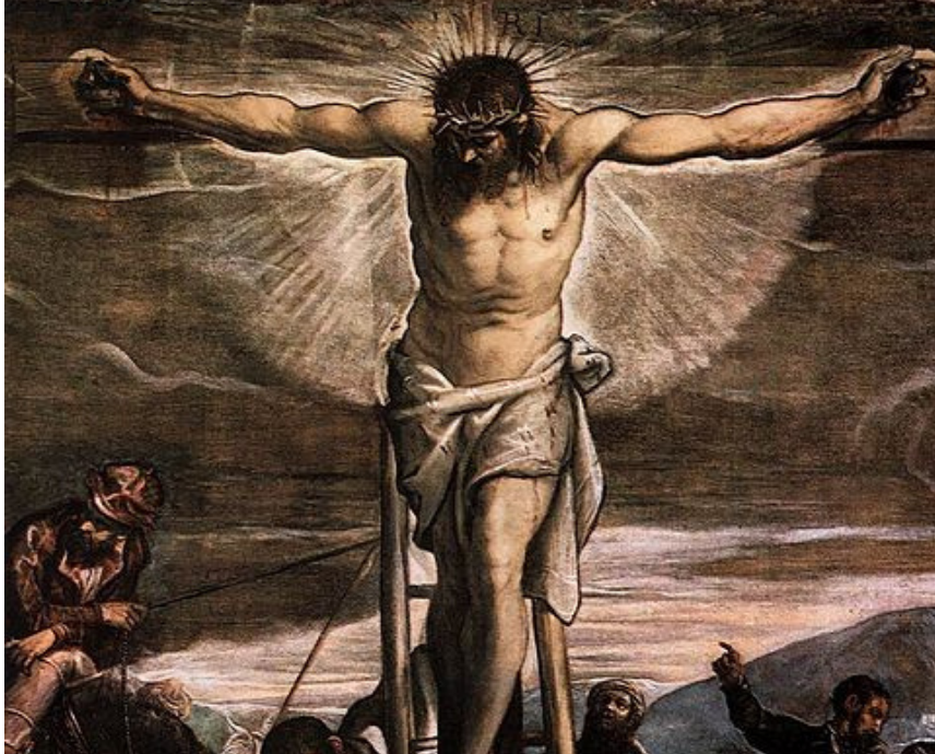
Jacopo Tintoretto, Public domain, via Wikimedia Commons