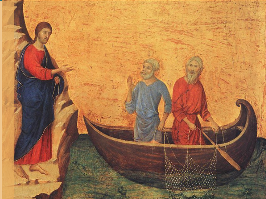
Duccio di Buoninsegna, Public domain, via Wikimedia Commons