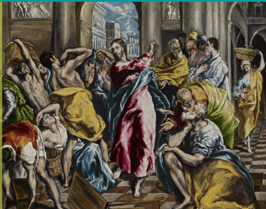
Christ Cleansing the Temple by El Greco

"Stop turning my Father's house into a market"