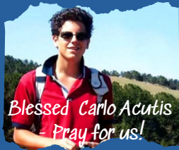
Blessed Carlo Acutis Pray for us!