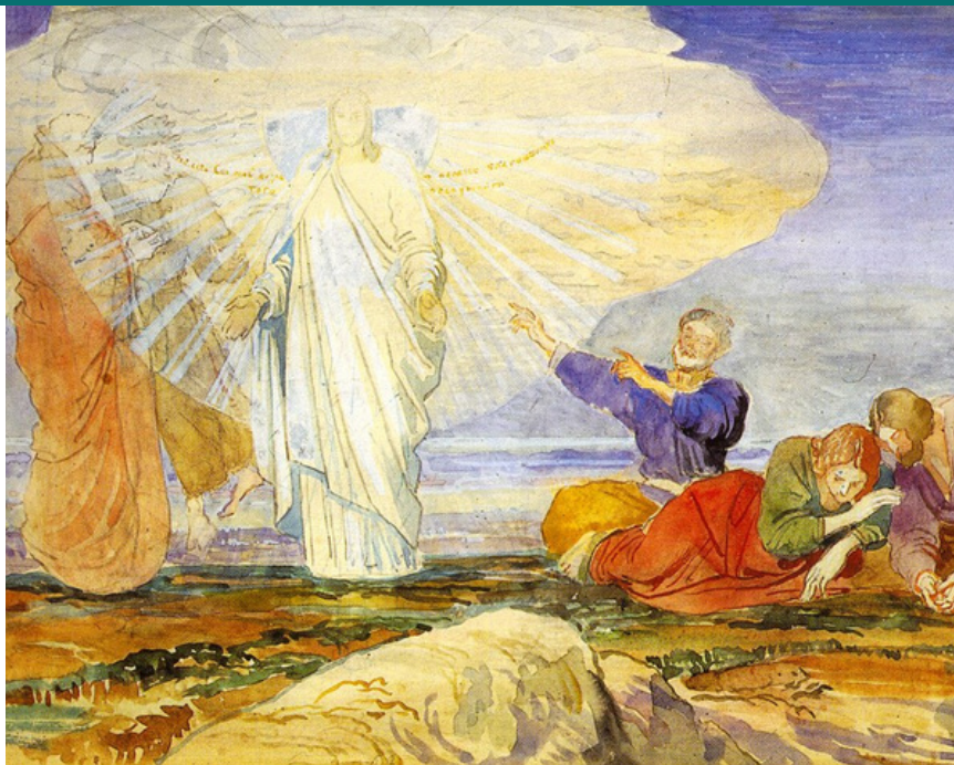
Alexander Andreyevich Ivanov