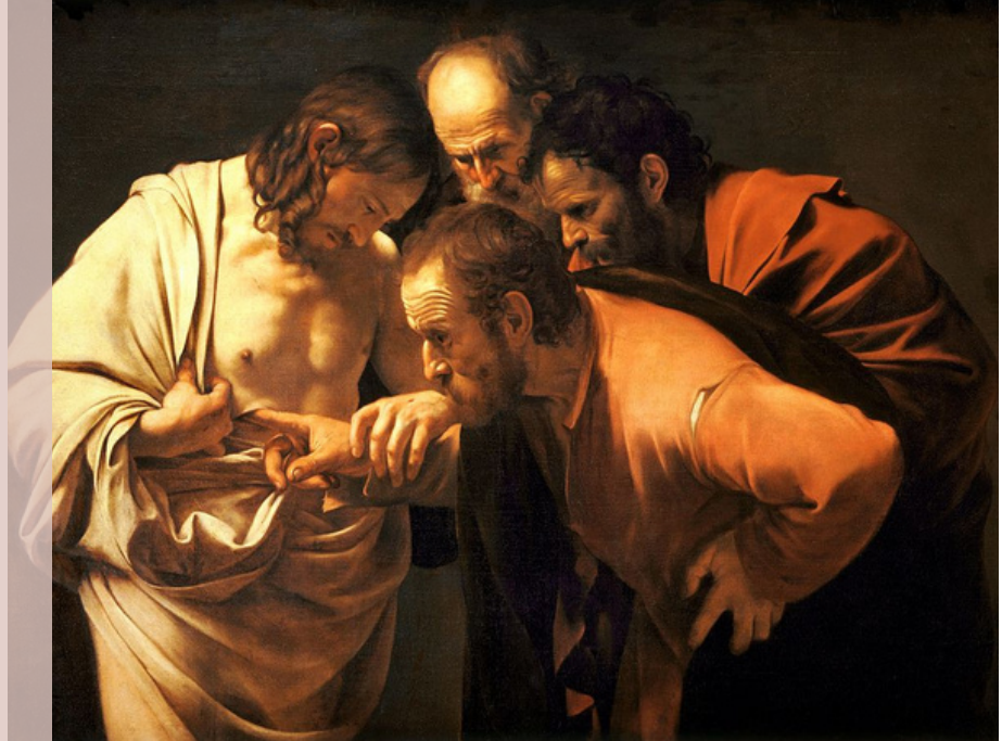
The Incredulity of Saint Thomas, Caravaggio

"You believe because you can see me. Happy are those who have not seen and yet believe"