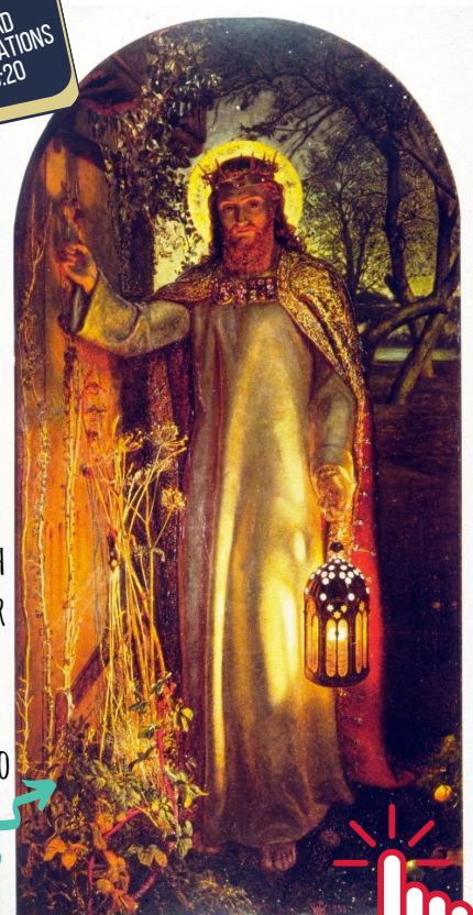
WILLIAM HUNT: "THE LIGHT OF THE WORLD"

NOTICE JESUS KNOCKING ON THE DOOR, WHICH IS OVERGROWN WITH WEEDS. THE DOOR REPRESENTS OUR HEARTS. NOTICE THERE IS NO HANDLE ON THE OUTSIDE. HE KNOCKS BUT WE HAVE TO DECIDE TO LET CHRIST IN.