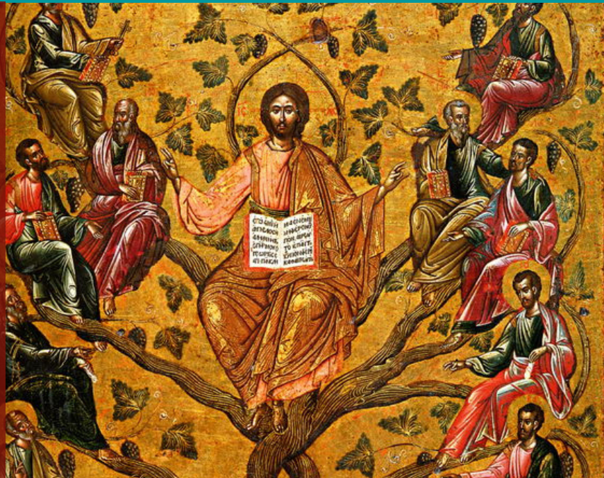
Christ the True Vine icon (Athens, 16th century)