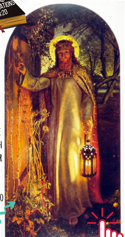
WILLIAM HUNT: "THE LIGHT OF THE WORLD"

NOTICE JESUS KNOCKING ON THE DOOR, WHICH IS OVERGROWN WITH WEEDS. THE DOOR REPRESENTS OUR HEARTS. NOTICE THERE IS NO HANDLE ON THE OUTSIDE. HE KNOCKS BUT WE HAVE TO DECIDE TO LET CHRIST IN.