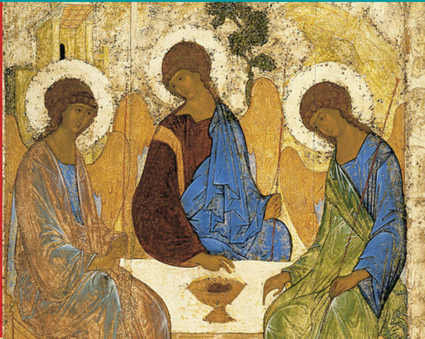
Trinity Icon, Rublev, CLICK FOR FULL IMAGE

"Know that I am with you always; yes, to the end of time"