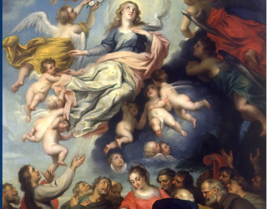
Assumption of Mary

"The Almighty has done great things for me. Holy is His name"