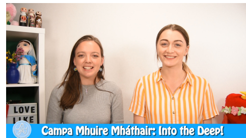
Campa Mhuire Mháthair: Into the Deep!

Campa Mhuire Mháthair: Free Online Catholic resources for Children aged 5 - 12. Great for Sacramental Preparation too. For more info, click here