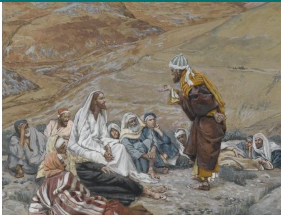
James Tissot