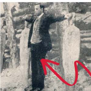
Fr. Miguel Pro was beatified on September 25, 1988 by Pope John Paul II and his feastday is November 23rd.

Facing the firing squad in the prison courtyard, Fr Pro blessed the soldiers, then knelt quietly in prayer. He refused to wear a blindfold, but rather stood facing his