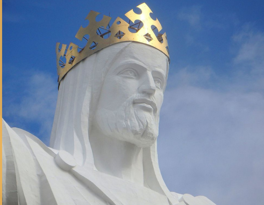
Dominikosaurus, CC BY-SA 4.0 < https://creativecommons.org/licenses/by-sa/4.0/ >, via Wikimedia Commons