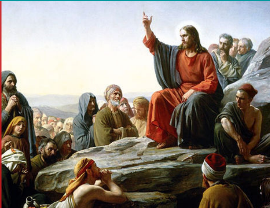
Carl Bloch, Public domain, via Wikimedia Commons

"Love your enemies and do good, and lend without any hope of return..."