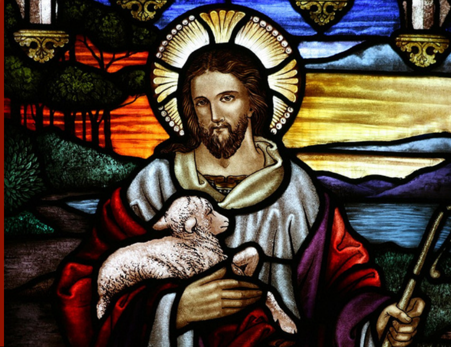
Stained glass: Alfred Handel, d. 1946[2]

"The sheep that belong to me listen to My voice"