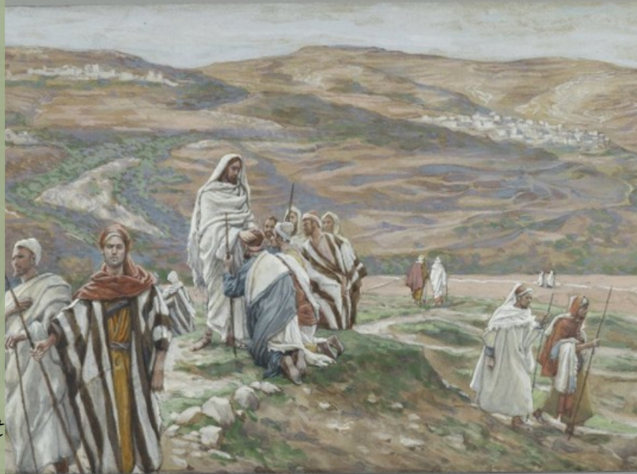
James Tissot, Public domain, via Wikimedia Commons

"The harvest is rich but the labourers are few, so ask the Lord of the harvest to send labourers to His harvest..."