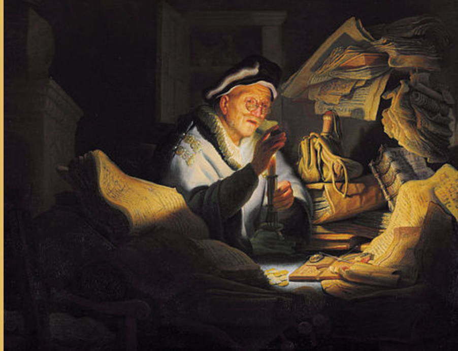
Parable of the Rich Fool, Rembrandt

"A man's life is not made secure by what he owns, even when he has more than he needs."