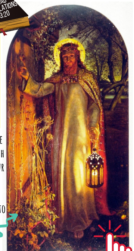
WILLIAM HUNT: "THE LIGHT OF THE WORLD"