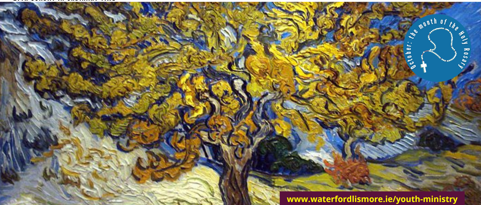
The Mulberry Tree, Vincent van Gogh