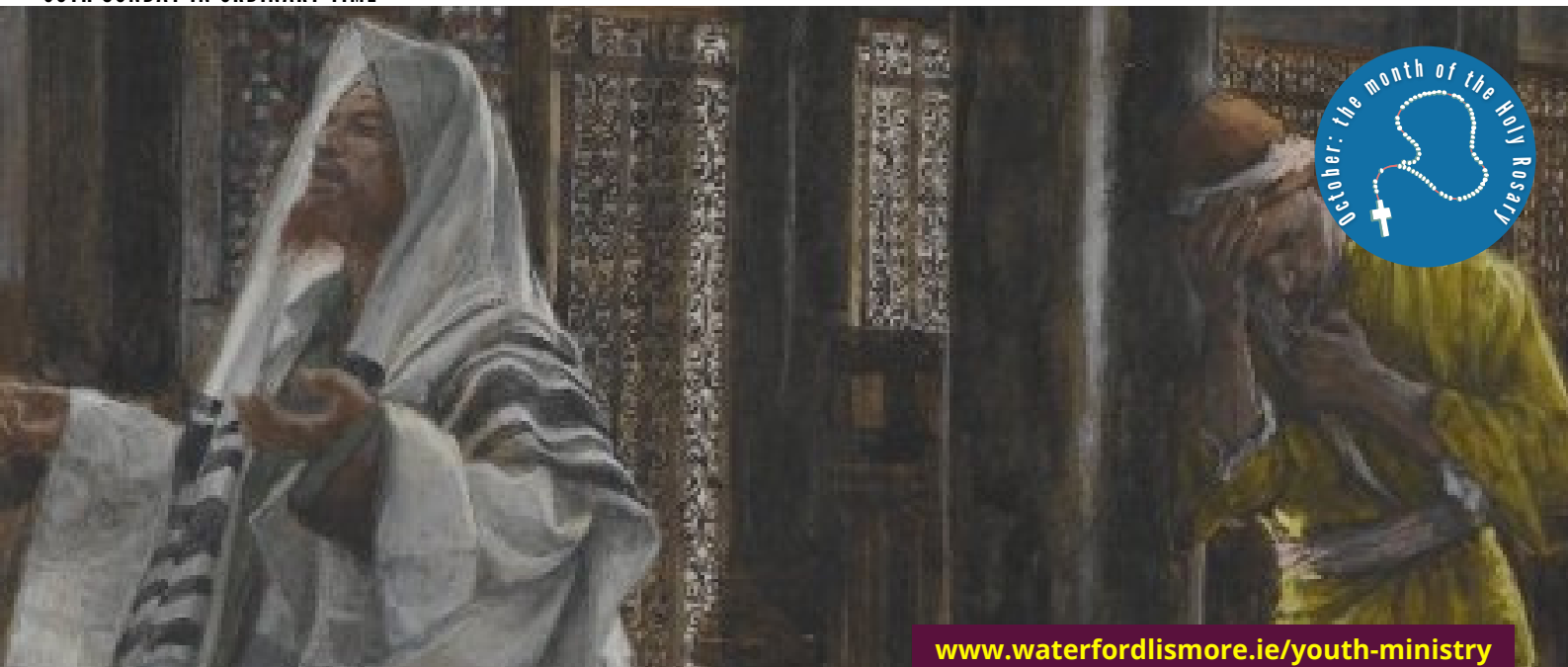
James Tissot