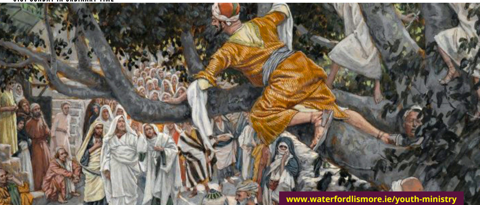
James Tissot