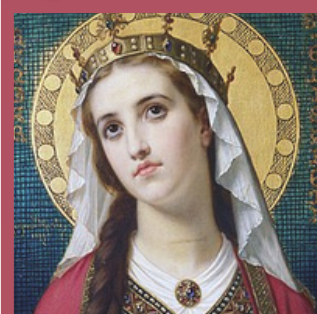
St Elizabeth of Hungary 17 November