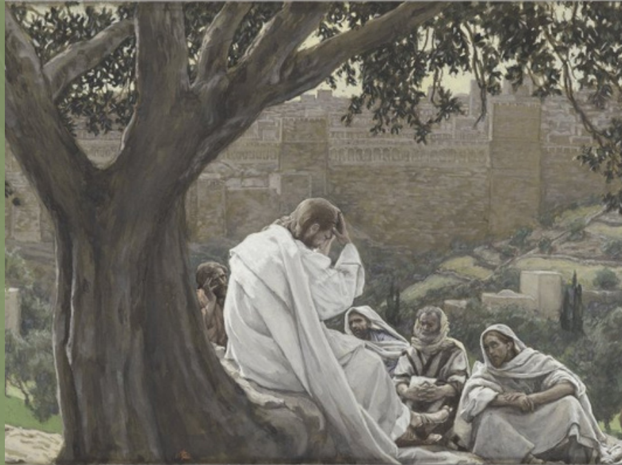
The Prophecy of the Destruction of the Temple, James Tissot

"Take care not to be deceived," he said, "because many will come using my name and saying, 'I am He'."