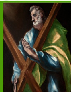
Saint Andrew, Apostle 30 November