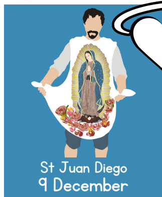
St Juan Diego 9 December