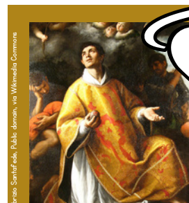
St Stephen 26 December