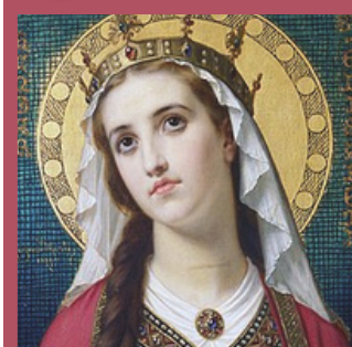
St Elizabeth of Hungary 17 November