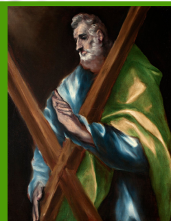
Saint Andrew, Apostle 30 November