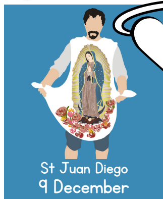
St Juan Diego 9 December