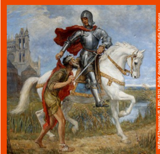
St Martin of Tours 11 November