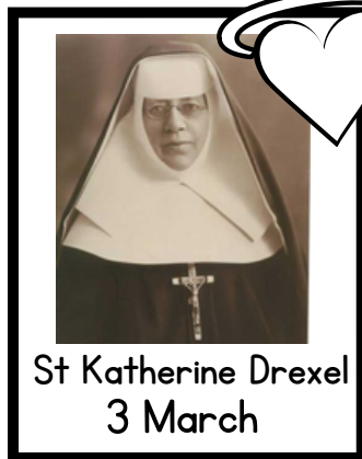
St Katherine Drexel 3 March