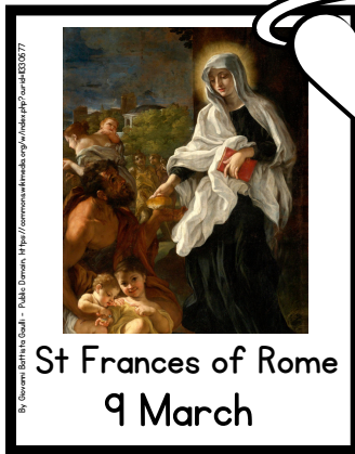
St Frances of Rome 9 March