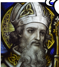
St Patrick 17 March