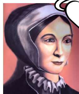
St Margaret Clitherow 26 March