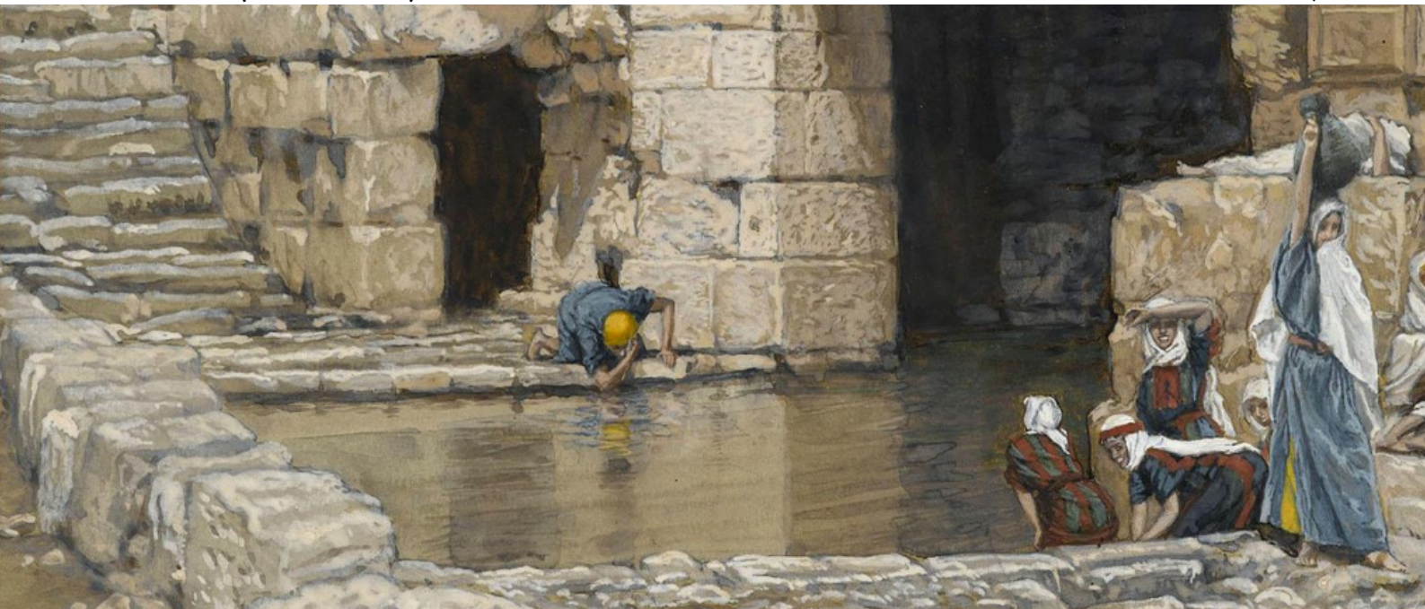
James Tissot, Public domain, via Wikimedia Commons

Download from www.waterfordlismore.ie/resources or subscribe to receive by email!