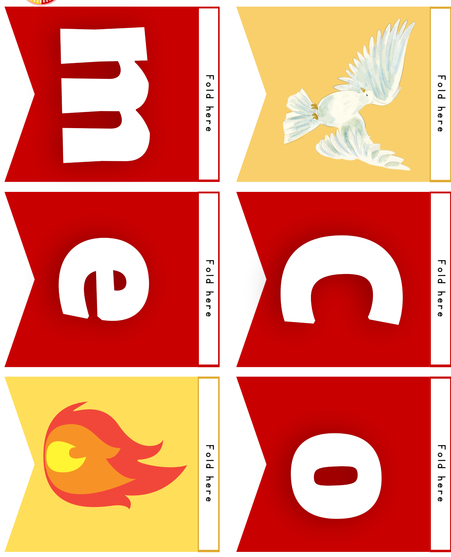
Cut out bunting shapes, fold over tabs and stick to string / ribbon PAGE 8 - ASCEND YOUTH & YOUNG ADULT MINISTRY (DIOCESE OF WATERFORD & LISMORE) -