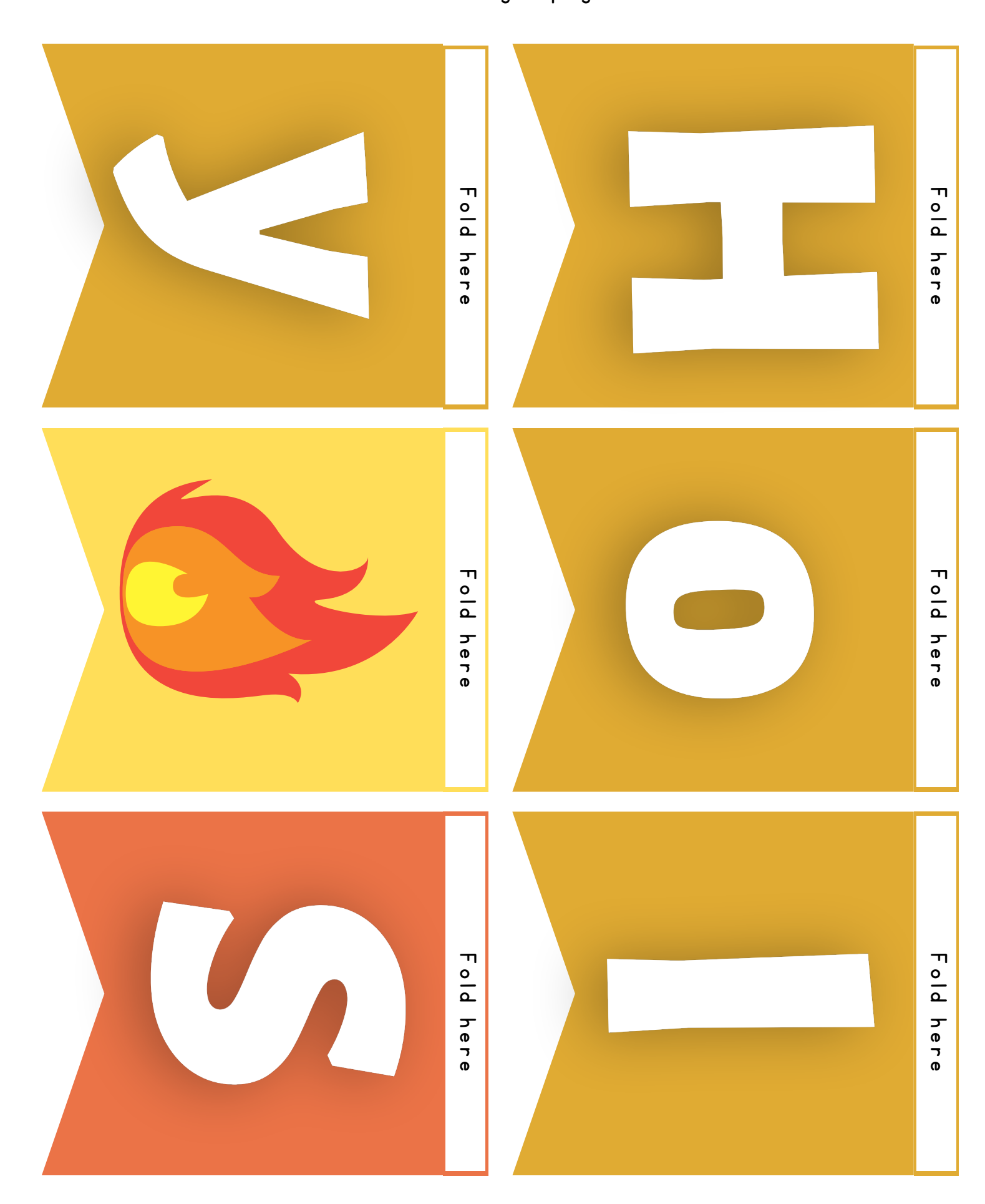
Cut out bunting shapes, fold over tabs and stick to string / ribbon PAGE 9 - ASCEND YOUTH & YOUNG ADULT MINISTRY (DIOCESE OF WATERFORD & LISMORE) -