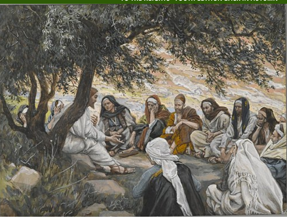
James Tissot, Public domain, via Wikimedia Commons

"You received without charge, give without charge."