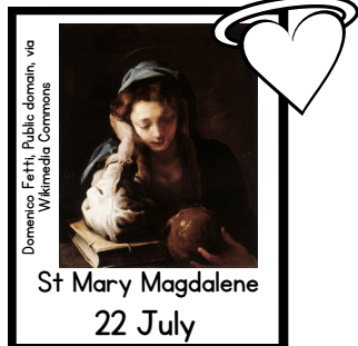
St Mary Magdalene 22 July