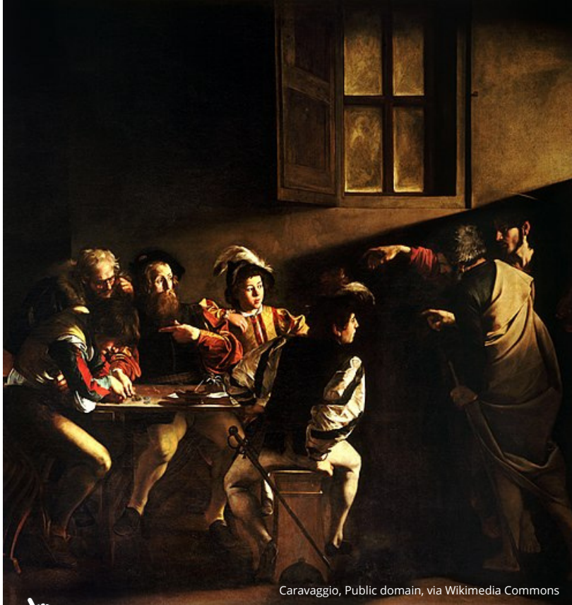
Caravaggio

Carravaggio's famous work, "The Calling of Saint Matthew" illustrates the passage in the Gospel of Matthew (Matthew 9:9), when Jesus invited the tax-collector, Matthew, to follow Him. According to the story Matthew rose and followed him. In the painting, Christ (on the right, behind Peter) points to Matthew, the tax-collector, (the bearded man wearing a beret) - and calls upon him to become the apostle Matthew.