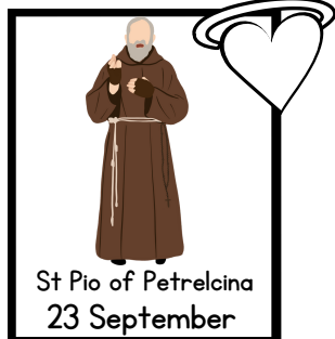
St Pio of Pietrelcina 23 September