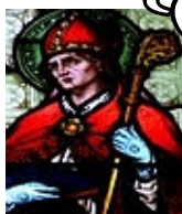
St Otteran 27 October