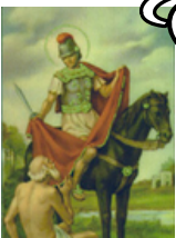
St Martin de Tours 11 November