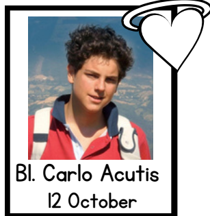
Bl. Carlo Acutis 12 October