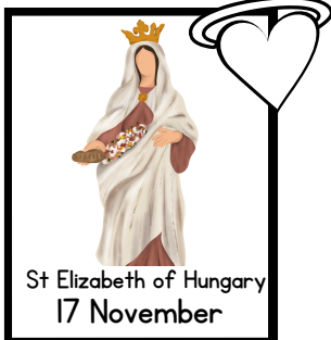
St Elizabeth of Hungary 17 November