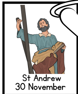
St Andrew 30 November

Jesus is the King of the Universe - and He's a good King who loves us all. How can we act like Jesus is our King? What kind of things does He ask us to do? How can we build His kingdom by the way we show love to others? What can you do?