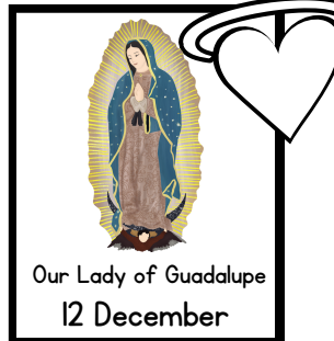
Our Lady of Guadalupe 12 December

What do you think John the Baptist looked like? Draw a picture of him here!