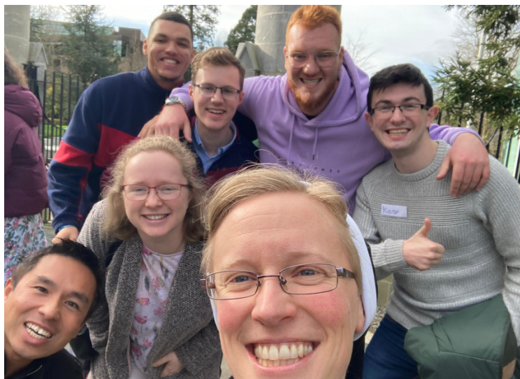
Some young people from the Diocese of Waterford & Lismore at the Connect4 Conference in UCC last week!

Download from www.waterfordlismore.ie/resources or subscribe to receive by email!