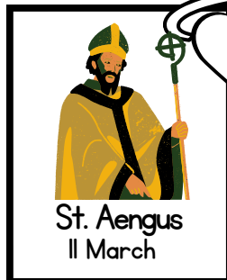
St. Aengus 11 March