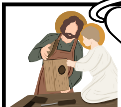
St Joseph 19 March

Father follow glorify Jesus life name serve wheat