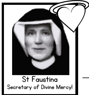
St Faustina Secretary of Divine Mercy!