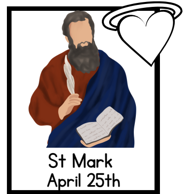
St Mark April 25th

The Lord is my Shepherd, there is nothing I shall want. Amen